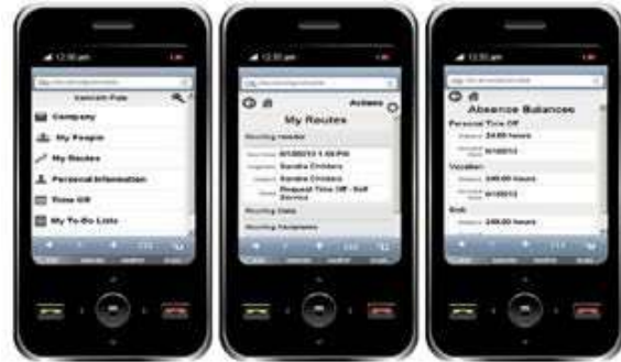
Employees stay connected with HCM Mobile Connect.

and customizing the menu layout. You can also use this task to control employee access to the mobile portal. So, whether you provide mobile devices or support a bring-your-own-device policy, your managers and employees can complete tasks, view information and access data conveniently.