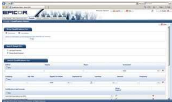
Use Qualification Match to quickly identify potential candidates for open positions.

Searching for qualified applicants takes time. Epicor HCM provides powerful tools that help match qualified applicants to open positions, reducing the time you spend filtering through resumes. When a requisition closes, the system automatically notifies all other candidates when you've filled the position. Because Epicor HCM staffing management is part of your complete system, you eliminate duplicate data entry. Epicor HCM seamlessly converts applicant data into employee data when you hire a candidate.